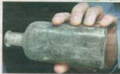
By BEN BRIGGS

Historic find sheds light on town's old walkways